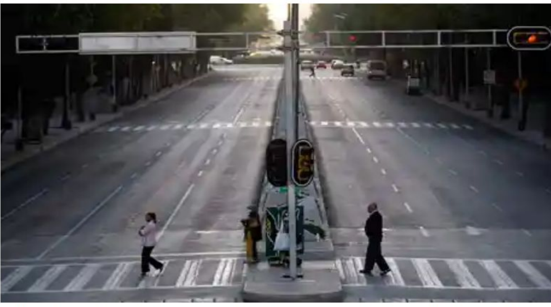
People cross a normally busy street in Mexico City. The authorities have ordered a five-day shutdown to halt further spread of the H1N1 flu virus.

It was the silence more than anything. No rumble of traffic. No voices in the street. No footsteps. Nothing to betray the existence of 20m people.